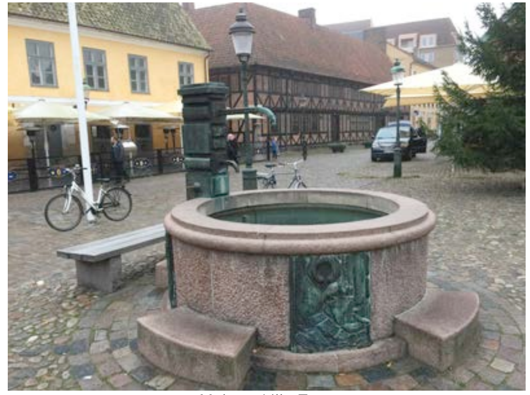
Malmø, Lilla Torg

From Malmø you can return to Copenhagen by motorway under the tunnel of the bridge or, to return to Helsingør, taking the ferry again.