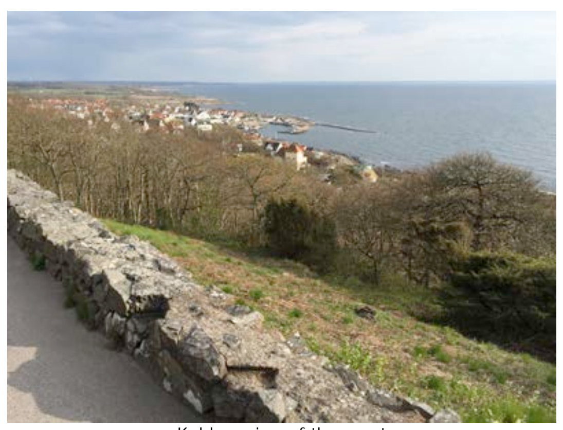
Kulden, view of the coast

Once visited Sofiero, then visit the coast for a few km until Kulden, the peninsula.