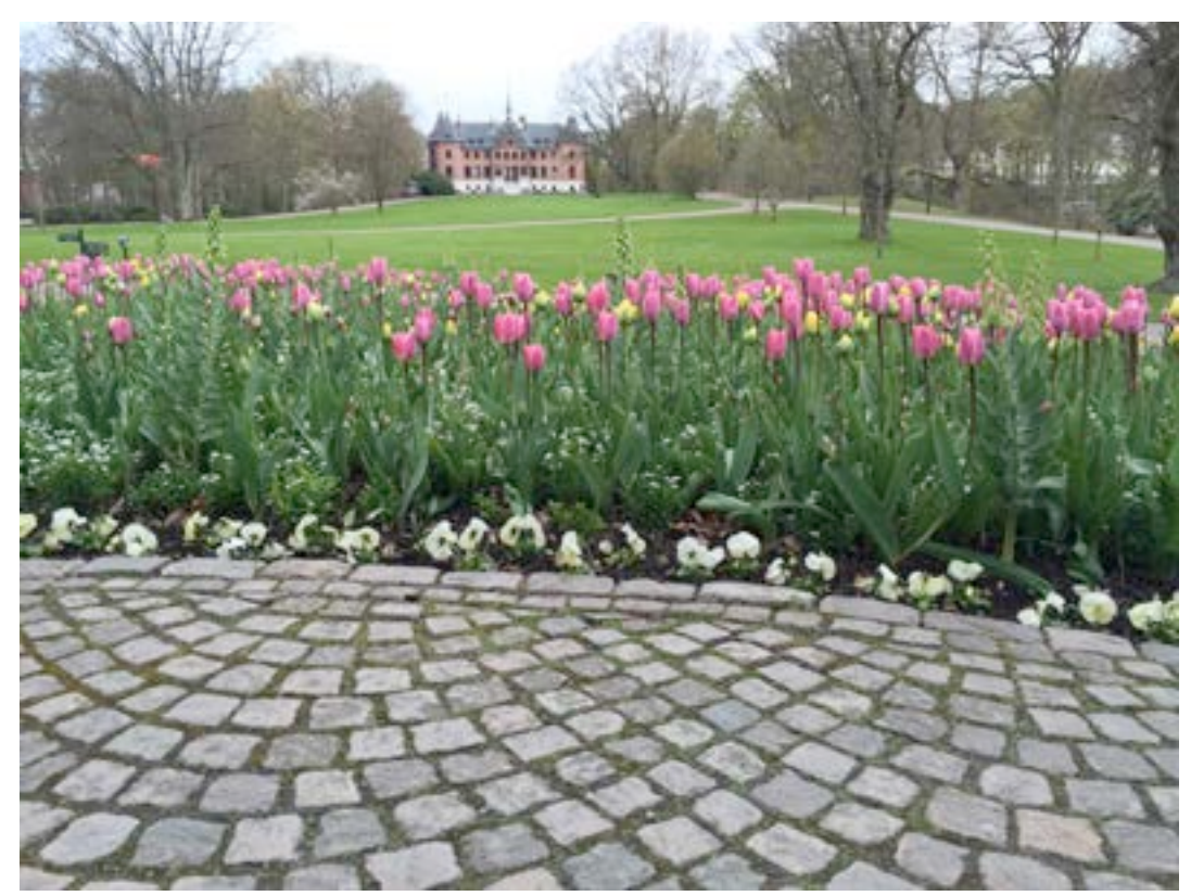
Il castello estivo di Sofiero

It was the summer residence of the kings of Sweden, until a few years ago.