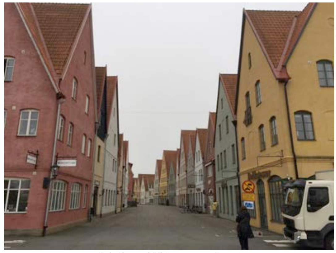
Jakriborg i Hjärup near Lund