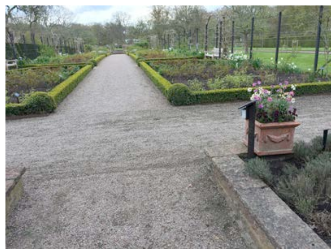
Sofiero, geometric garden