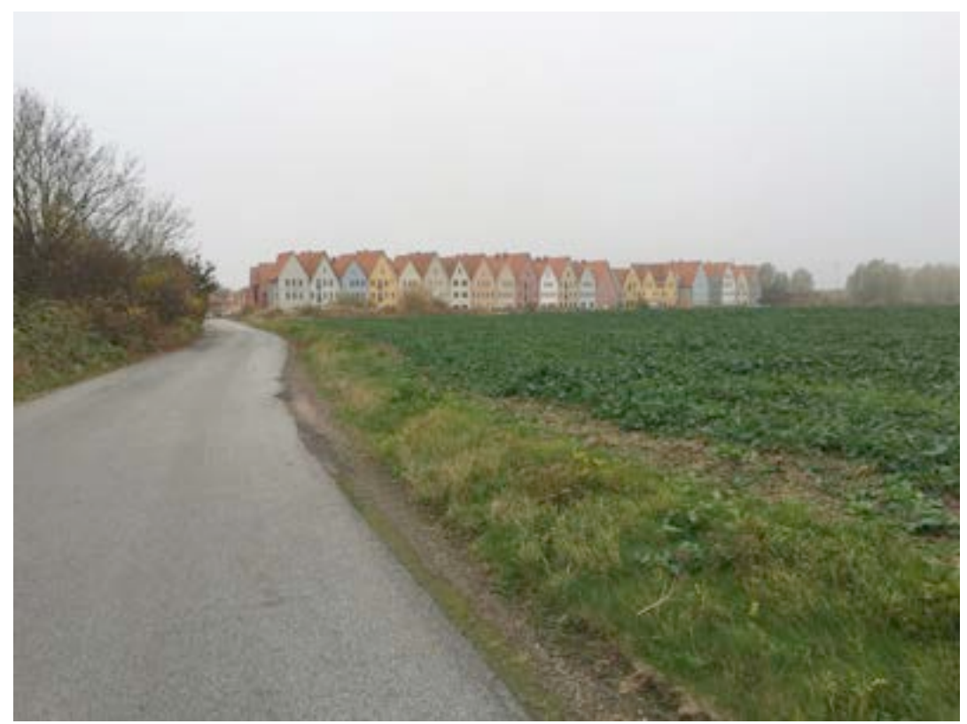
Jakriborg i Hjärup near Lund