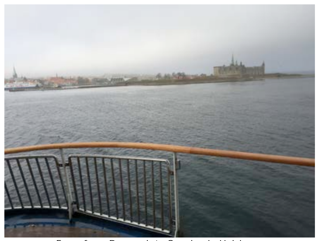
Ferry from Denmark to Sweden in Helsingør

Fx prices are even higher that in Denmark, and it is not charming.