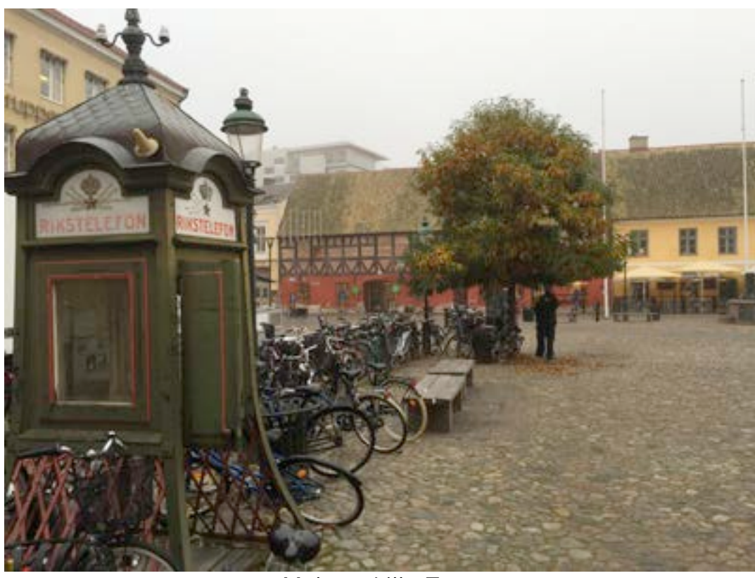
Malmø, Lilla Torg