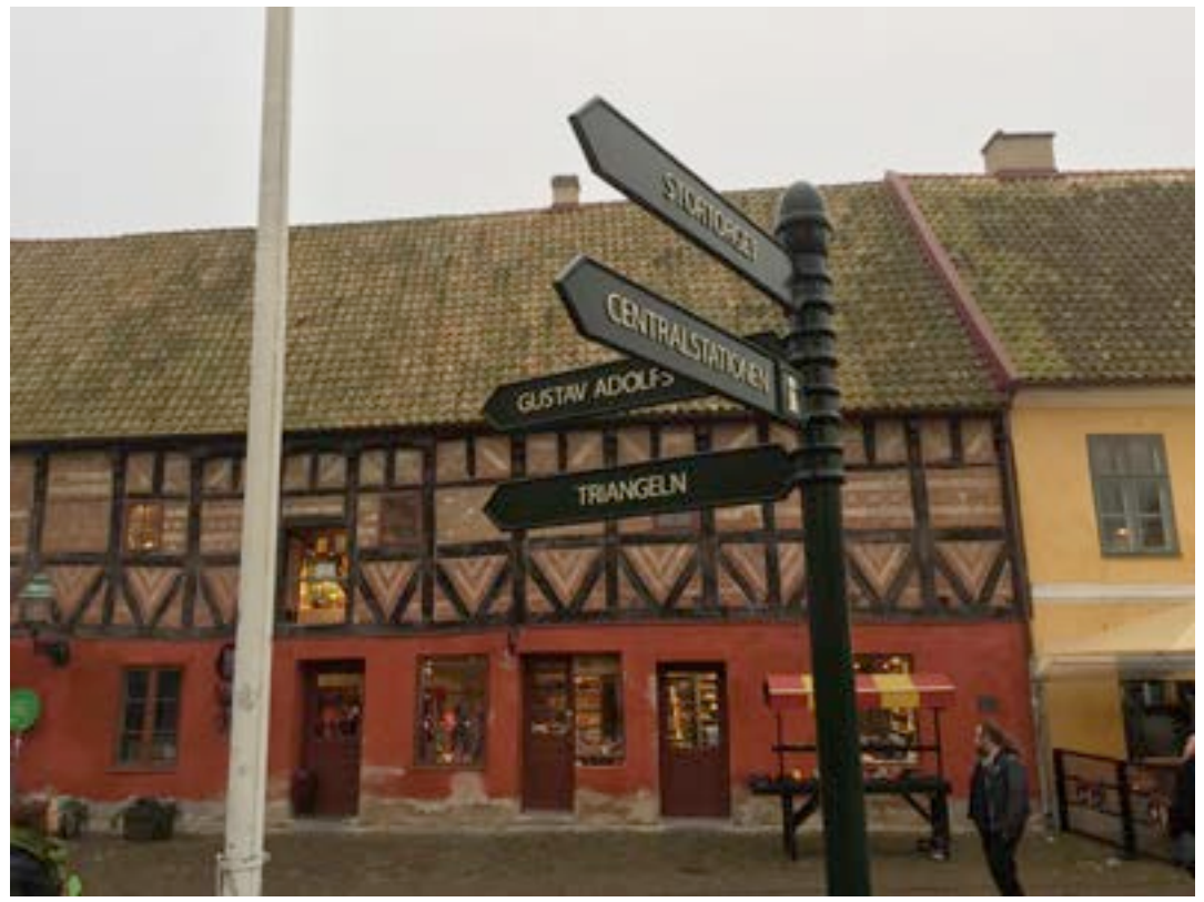
Malmø, Lilla Torg

Malmø is also a city that has tried new styles of architecture, especially in the area where there was the port and the shipyards.